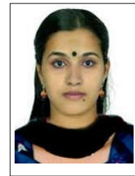
Acceptable format of Sample Photograph